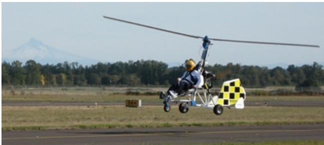
Above: Kevin Richey lands at Scappoose.

The next meeting will be June 12, 2010 at 1:00 PM in Scappoose, OR at the Sport Copter Hangar. The meeting was adjourned at approximately 2:26 PM.