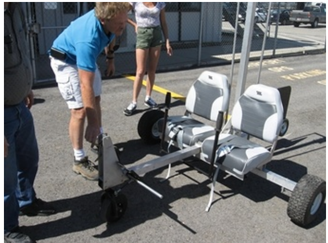
...unfold the keel, mast and control rods, slide the twin pump-handle joysticks into their receiver tube, a few more bolts and...voila! Ready for rotorblades!