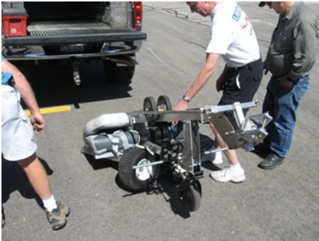
...Fold the main gear axles out and bolt in place...