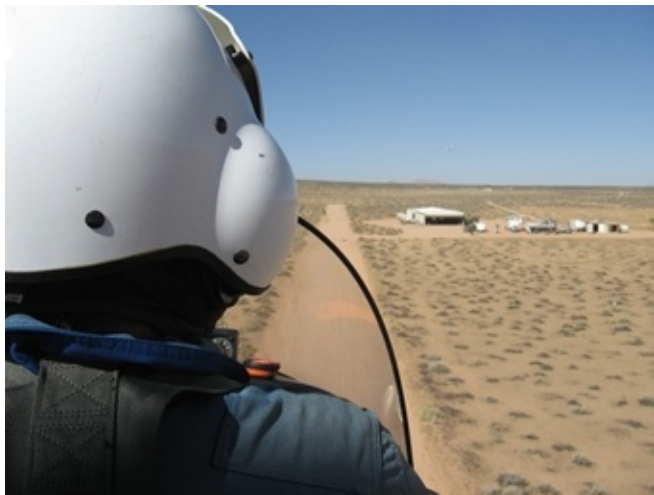
Above,, the view from the back seat of the Predator as Vance flies over the dirt strip at the Brock ranch.